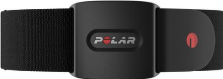
Polar H10 Heart Rate